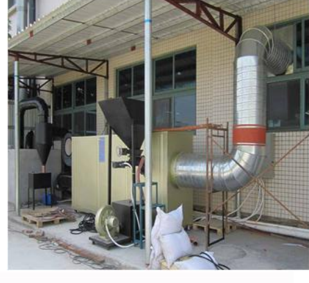
900,000 kcal matching hot blast stove