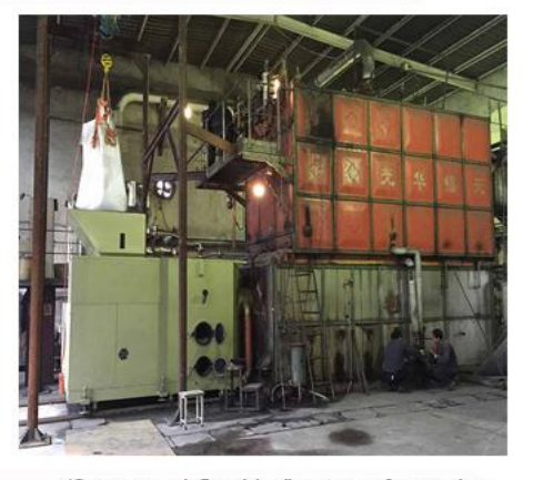
10 ton coal-fired boiler transformation