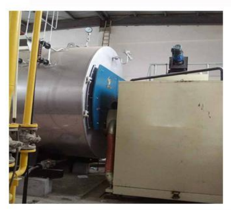
8 tons biomass steam boiler