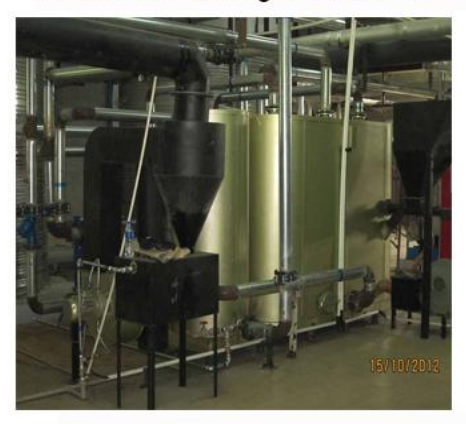
1.2 million kcal supporting water heater