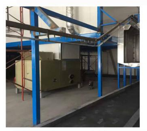
Biomass burner tunnel drying