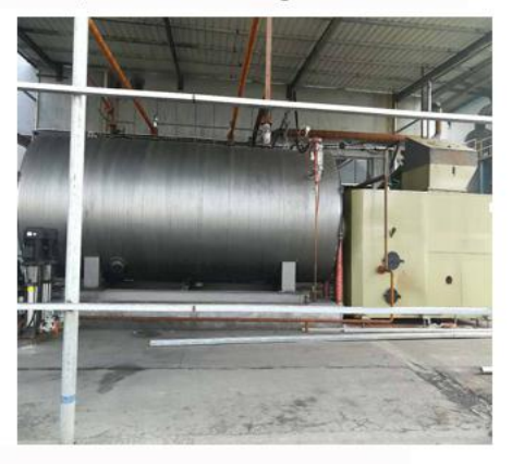
10 tons hot water boiler