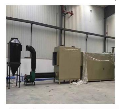
1.2 million kcal matching hot blast stove